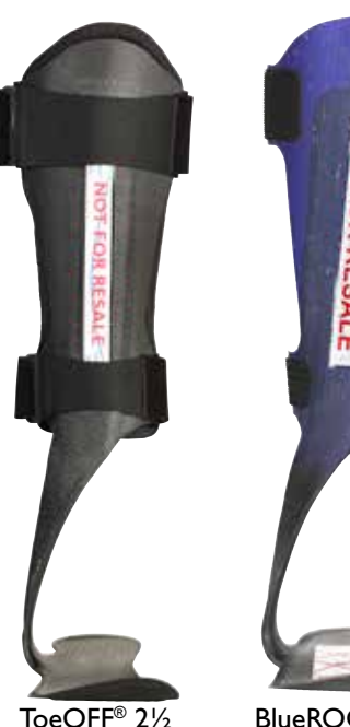
ToeOFF® 2½ BlueROCKER® 2½ ToeOFF® 2.0 BlueROCKER® 2.0 ToeOFF® FLOW 2½